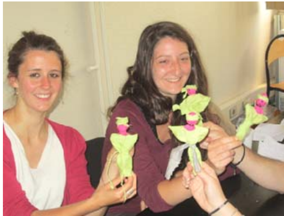
Make your own recycled doll!