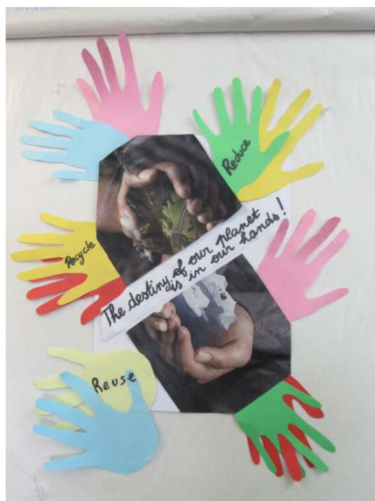
A 3Rs poster