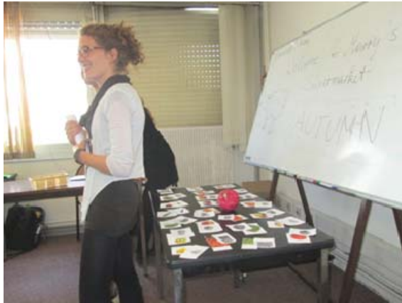
The seasons of fruit and vegetables