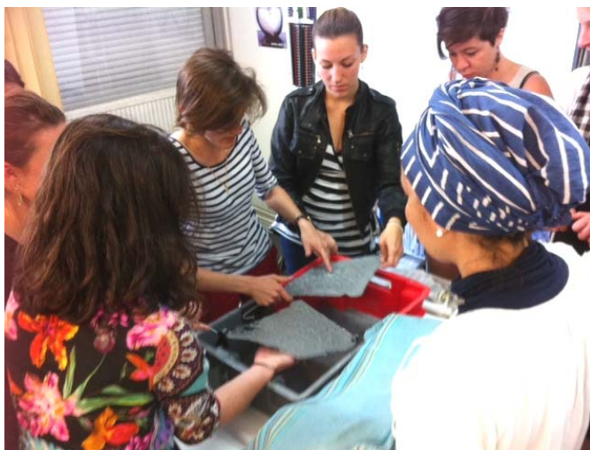
Recycled paper workshop