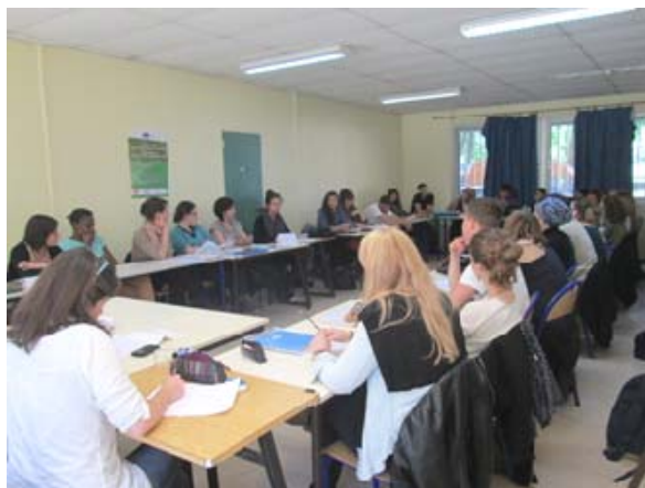
The sustainable debate